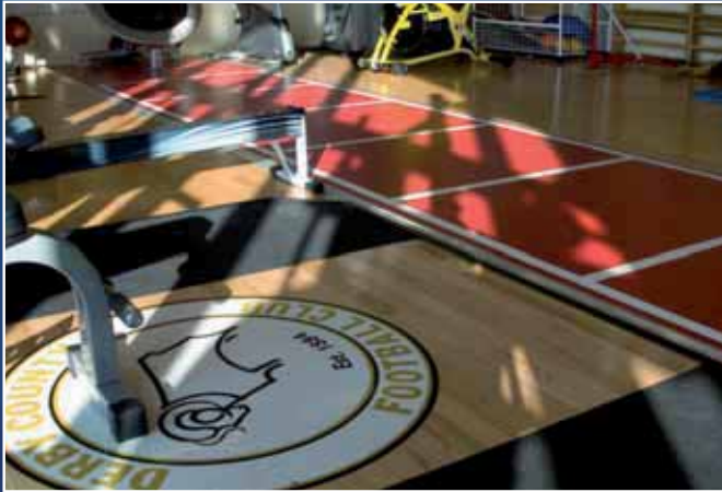
Derby County Indoor Training Centre Sprint Track.