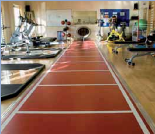
Above: Derby County Indoor Training Centre Sprint Track Middle: Chilwell Olympia Below Certificate Award presented at Chilwell Olympia

We can offer various systems to suit all types of indoor sports with thicknesses varying from 10mm - 150mm including a self levelling system to achieve a true flat floor. There are a range of finishes available including wood surfaces, rubber and wide ranging vinyl effects; our main suppliers being Gerflor, Junckers, Boen/Boflex, Tarkett, Polyflor, Altro, Armstrong and Kahrs.