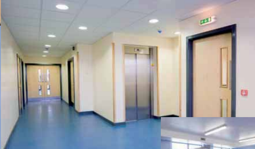
De Ferrers School