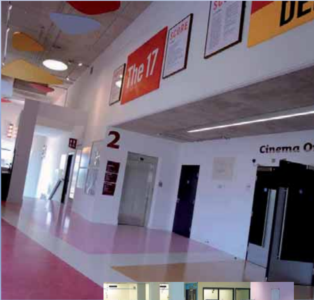
Above: The Quad, Derby Right: Royal Derby Hospital