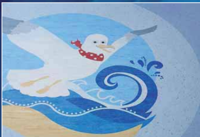
Royal Derby Hospital