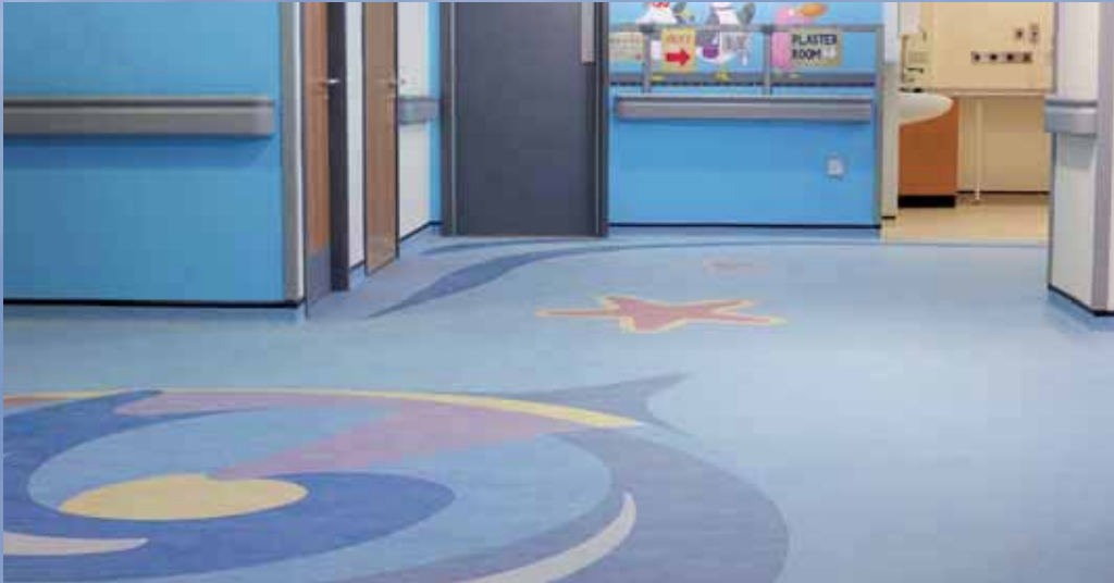
Royal Derby Hospital