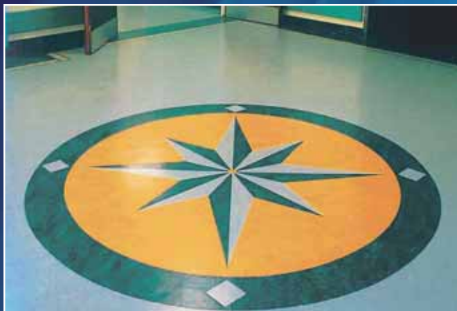
Chesterfield Royal Hospital