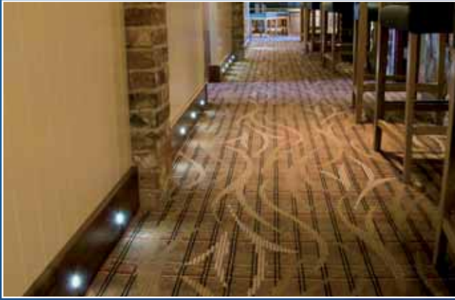
Morley Hayes Bar Area.