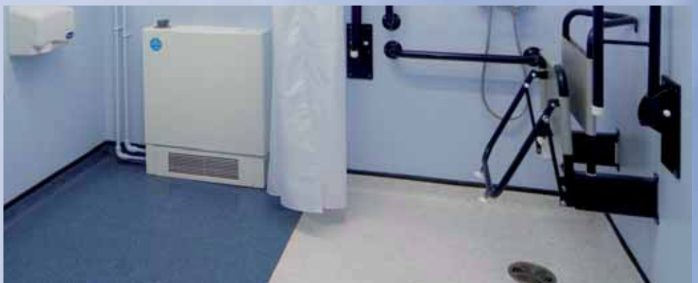
De Ferrers School Disabled Shower Room

Walls: As part of many of our vinyl installations we are required to cove the flooring up the wall by 100-150mm to provide an impervious floor area, this is especially useful in areas such as bathrooms, toilets and sluices in hospitals, nursing homes, schools and industrial locations. To full wet rooms and clean rooms, for example, showers, food preparation rooms, kitchens, abattoirs, veterinary rooms or anywhere where wall cleanliness is imperative, standard vinyl can be installed on vertical surfaces to provide an easy to clean, impervious finish. Alternatively, specialist wall vinyl manufactured by Tarkett, Gerflor and Polyflor can be fully bonded to the walls to provide a neat, waterproof finish. We have recently carried out such works for local Mental Health Trusts.