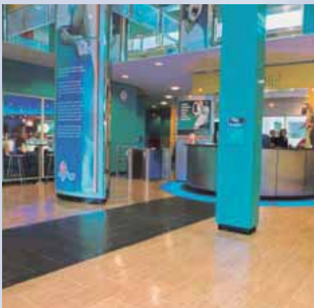
Above: Virgin Active Reception, Derby Right: Kedleston Park Golf Club.

We have carried out works locally for Morley Hayes Golf Hotel & Restaurant, The Quad, Kedleston Park Golf Club, The Derby Magistrates Court, Denby Pottery, Derby County Football Club, Virgin Active Derby, Derby and Nottingham Universities, nationally for Debenhams, Sainsburys and for many of the large major builders including Miller Group, Morgan Ashurst, Skanska, Bowmer & Kirkland and G.F. Tomlinson.