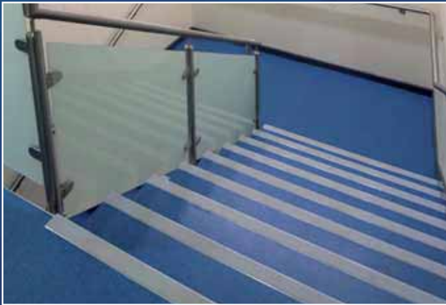
De Ferrers School