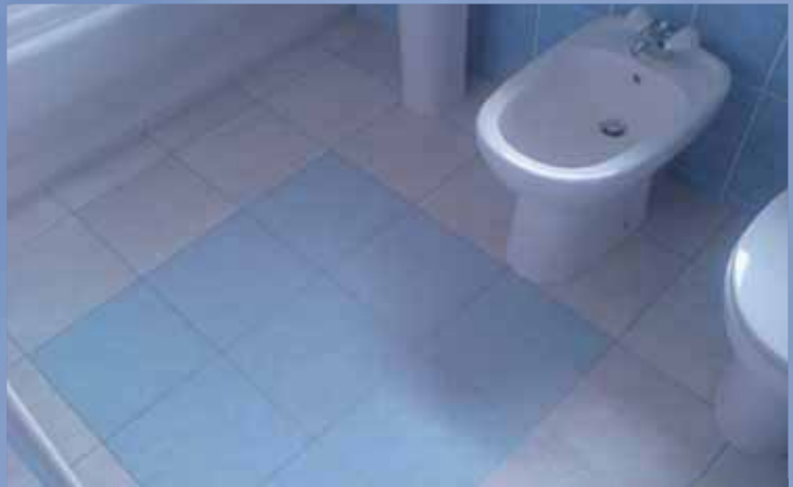
Residential flooring installations.