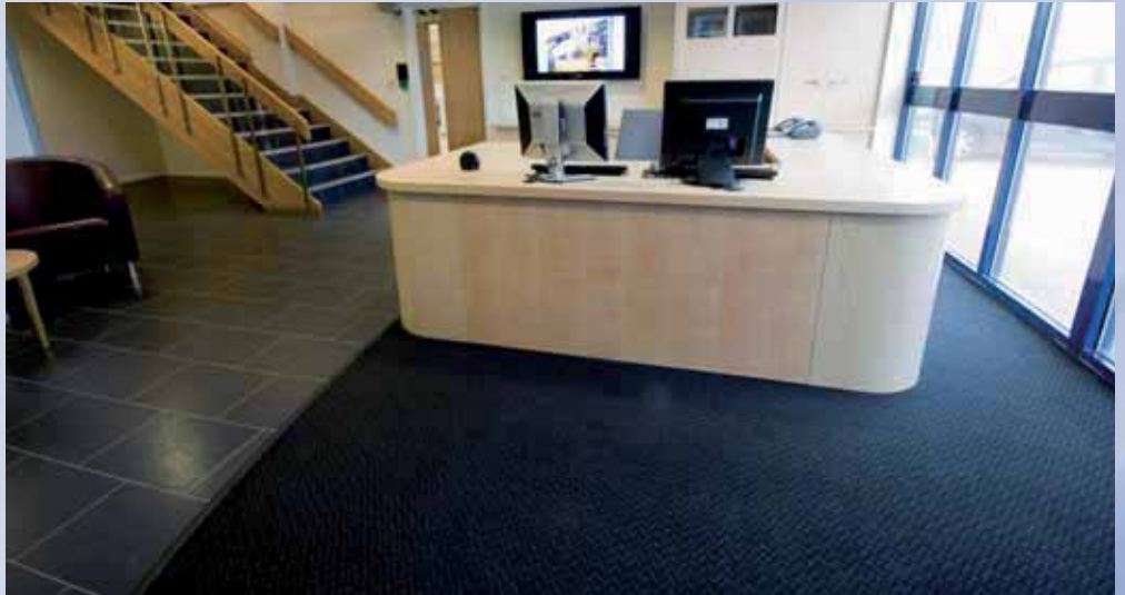
Daher Reception Area

An effective barrier matting system is essential in any entrance, creating a good first impression and aiding the removal of foot borne moisture and dirt, thereby reducing slipping and abrasion problems, protecting inner floor coverings and reducing maintenance costs.